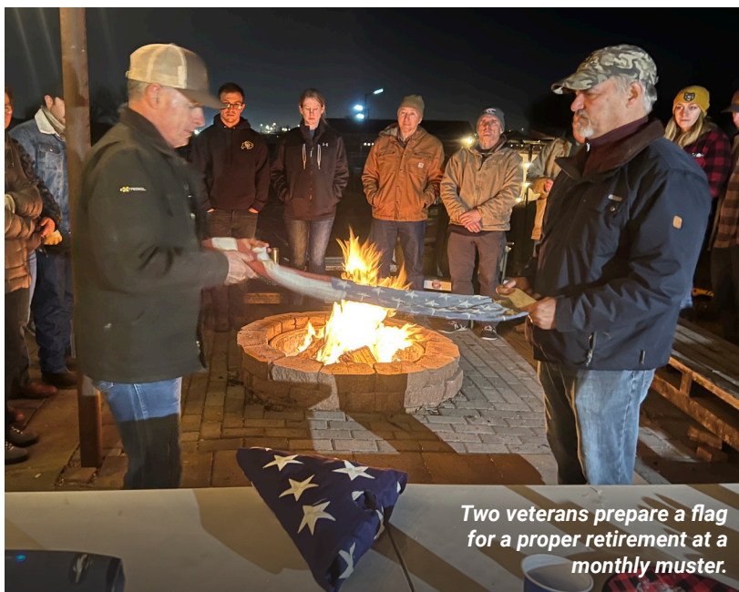
Two veterans prepare a flag for a proper retirement at a monthly muster.

Our vision is to prevent suicide in military and first responder communities by providing a sanctuary for humans and horses.